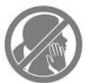
DON'T TOUCH YOUR FACE