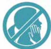
DON'T TOUCH YOUR FACE