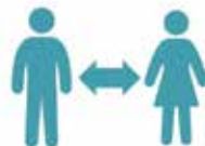
KEEP YOUR DISTANCE