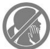
DON'T TOUCH YOUR FACE