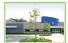
South Campus | Grades 4-8 2633 John R Road Rochester Hills, MI 48307

JESUS CHRIST IS THE REASON FOR OUR SCHOOL