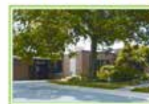
North Campus | Young 5 & K-3 1240 Inglewood Ave. Rochester, MI 48307